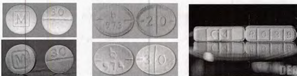
Left: Authentic oxycodone M30 tablets (top) vs. counterfeit oxycodone M30 tablets containing fentanyl (bottom). Center: Authentic Adderall tablets (top) vs. counterfeit Adderall tablets containing methamphetamine (bottom). Right: Authentic Xanax tablets (white) vs. counterfeit Xanax tablets containing fentanyl (yellow).

A significant number of high school and college students purchase Adderall and Xanax from dark web drug markets and/or through social media referrals 1 , which market deadly versions of these drugs tainted with fentanyl and/or methamphetamine. Some students begin using prescription stimulants, often referred to as "study drugs," in the belief it will benefit their academic performance, but the nonmedical use of prescription stimulants has not been proven to improve academic performance 2 .