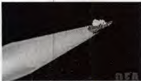
A lethal dose of fentanyl.

Counterfeit pills containing methamphetamine are highly addictive and act on the central nervous system. Taking even small amounts of methamphetamine can result in wakefulness, increased physical activity, decreased appetite, rapid breathing and heart rate, irregular heartbeat, increased blood pressure, and hyperthermia (overheating).